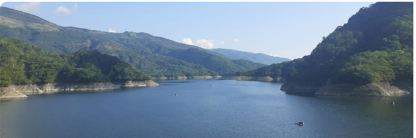
Figure 1: The Valdesia reservoir is the main drinking water supply for the population of the Dominican Republic's capital Santa Domingo.

Algal bloom treatment in a water surface as large as the Valdesia reservoir proved challenging for CAASD. The option to use chemical treatment was quickly eliminated. It would be impossible in terms of budget and operations to dose the entire reservoir multiple times a year with chemicals. It was also important to not cause any harm to the environment by using potentially harmful chemicals. This led CAASD, in their search for an environmentally friendly solution, to the MPC-Buoy.